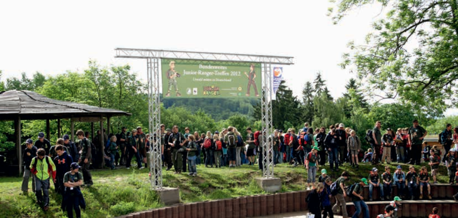
Junior Rangers at a national meeting in the Hainich National Park and Eichsfeld-Hainich-Werra Valley Nature Park