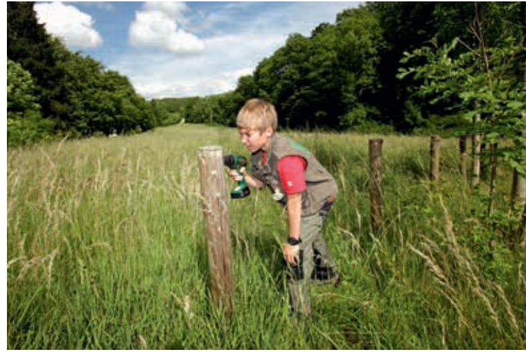
Junior Rangers are at home in the outdoors